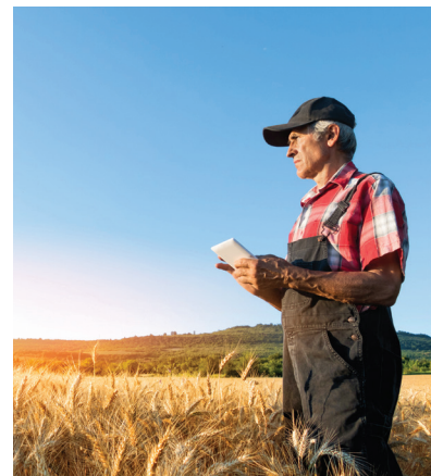
WIRELESS INTERNET SERVICE PROVIDER