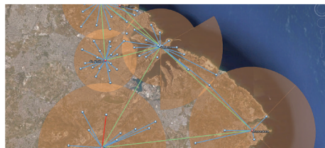
GOOGLE EARTH NETWORK VIEW