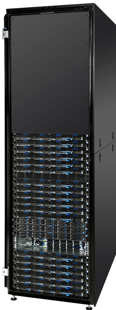
ActiveScale™ P100 System